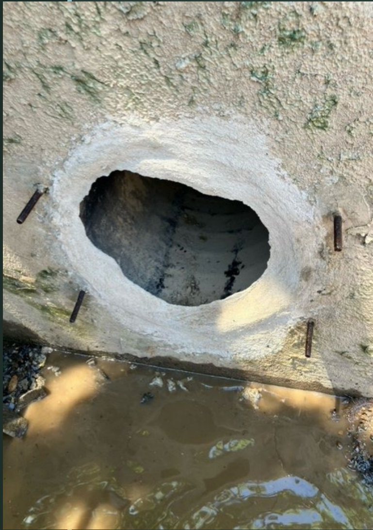
CCB Water loss repair